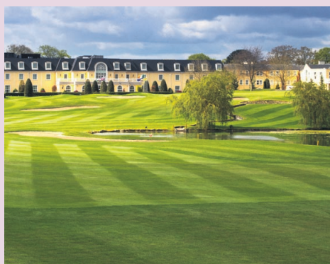
Mount Wolseley Hotel, Spa & Golf Resort, Tullow, Co. Carlow t: 059-9180100 w: www.mountwolseley.ie

Green fees from €40 to €60 with group rates available. Oak Park 9-hole course €10.