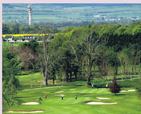
Carlow Golf Club, Deerpark, Dublin Road, Carlow t: 059-9131695 w: www.carlowgolfclub.ie

Golfers are guaranteed a warm welcome, great value and variety with plenty of options for the 19th hole in Carlow's vibrant pub and restaurant scene. Visitors can enjoy artisan craft beers and world class Irish whiskeys from Carlow Brewing Company and Walsh Whiskey. For further details on accommodation, golf and great things to do for non-golfing partners visit www.carlowtourism.com